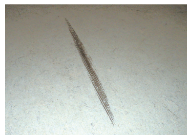
Example of scuff marks by shoes heels, frequently seen in heavy traffic areas.

*All the testing was conducted by TOLI's in-house labs unless otherwise specified. The data shows actual test results, not guaranteed value.