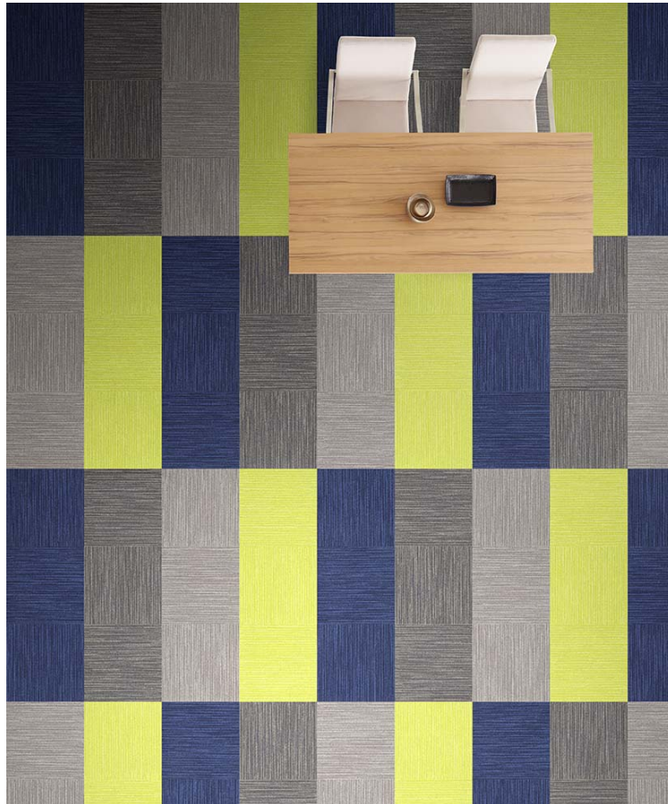
YU-2100 "URBAN HARMONY" (YU2102/YU2104/YU2105/YU2108)

In addition to YUTAKA1000, YUTAKA2000 SERIES has been newly launched as more design-oriented range. Value-added 3 patterns “URBAN HARMONY”, “NATURE CRESCENDO”, and “EARTH RHYME” will create new possibilities in your projects with their beautiful random and gradation images.