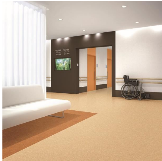
SF Floor NW