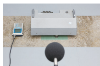
Testing device by TOLI R&D