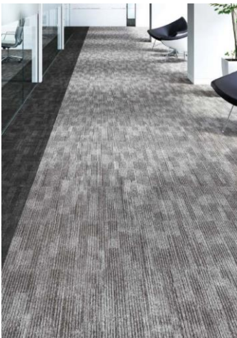
GA3662 / GA3663