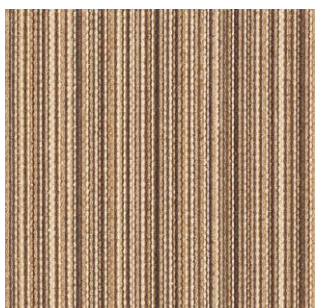
GA5551 7 colorways available