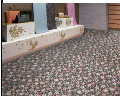
EXC2124F / EXC2125F