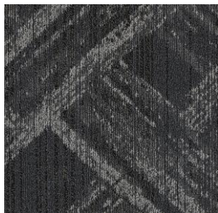
GX4131 4 colorways available