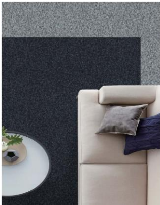
GX4701 / GX4702