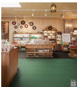
GX3027 / GX2303