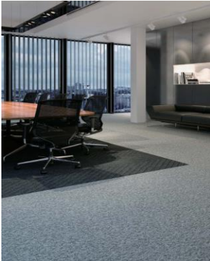
GX4752 / GX4701