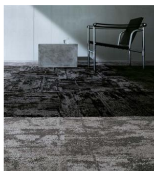
GX3701 / GX3702