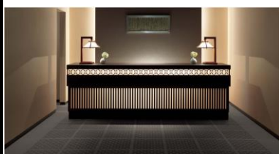
MT2702F / GX2005