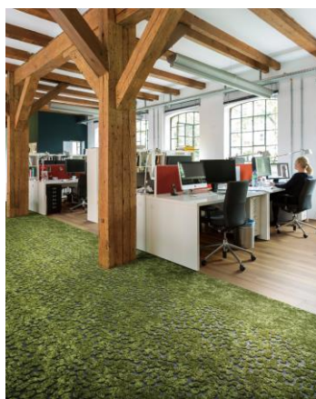
MT3811F / GX3801 / TTN3113