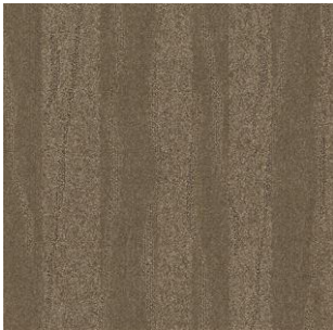
GX8401 4 colorways available